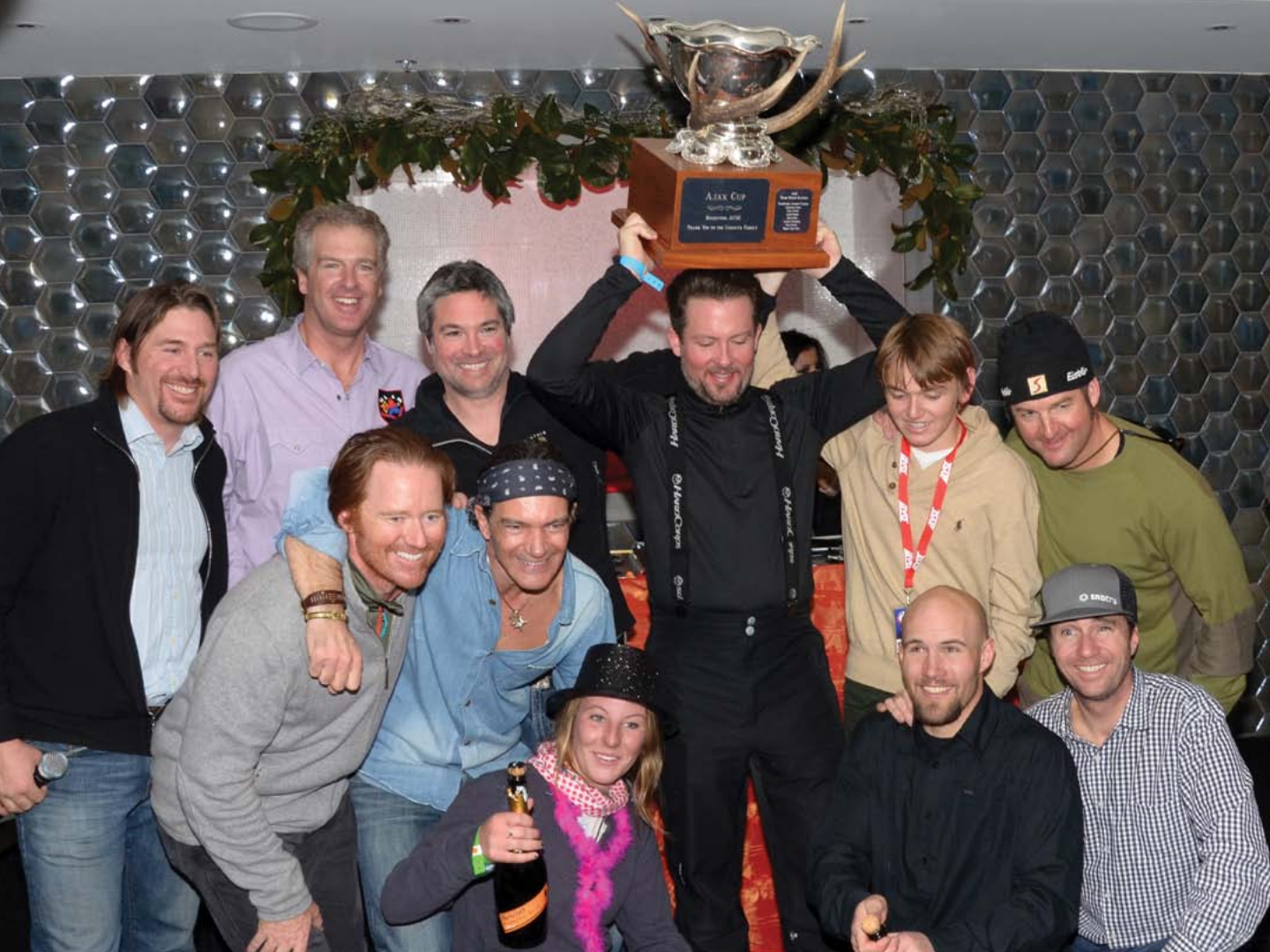
2012 Winning Team