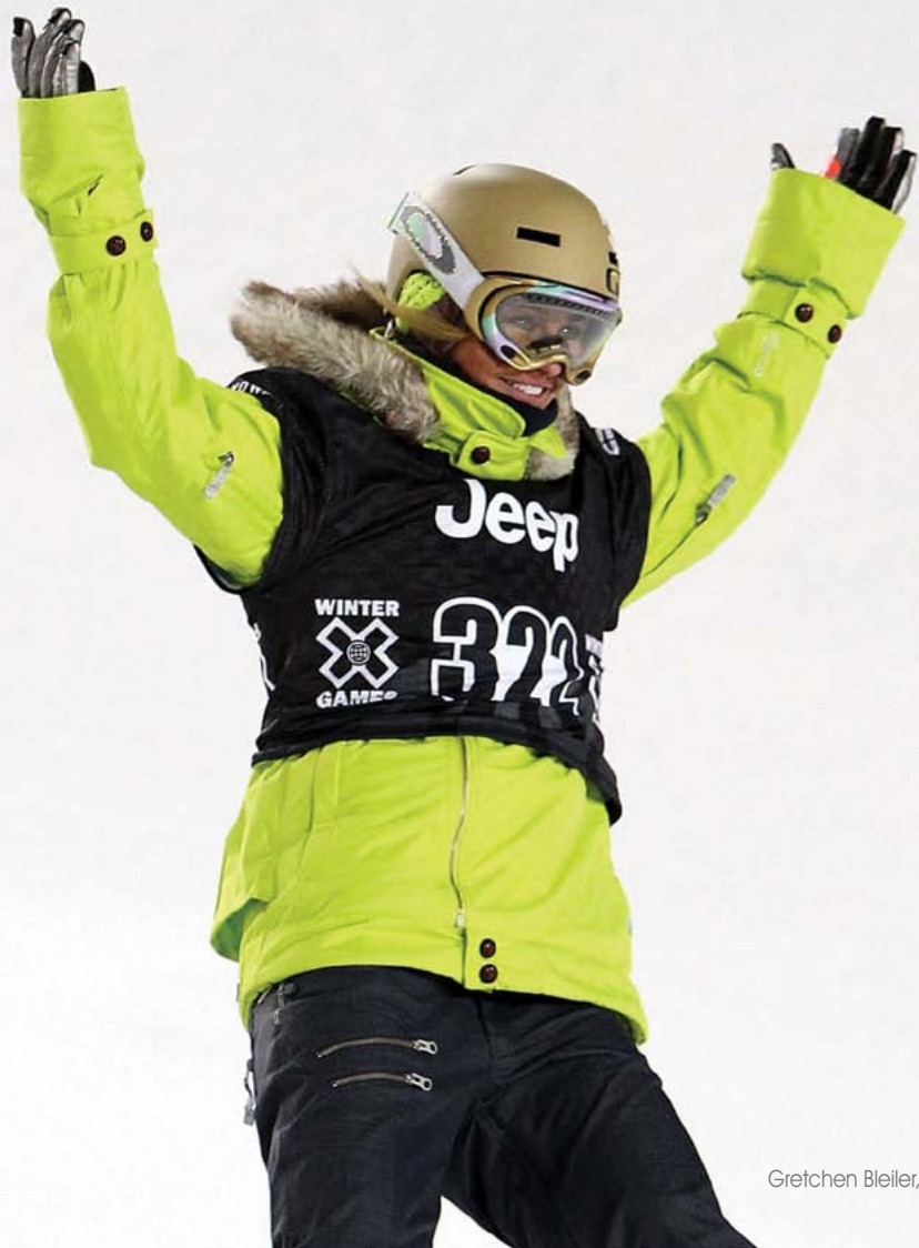
Gretchen Bleiler, 2006 Olympics and four-time Winter X Games Gold Medalist