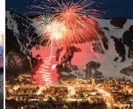
Aspen at night