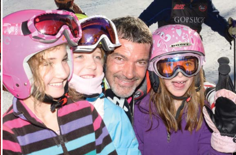
Antonio Banderas and AVSC future stars